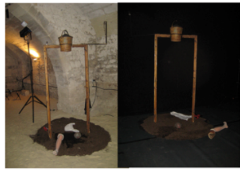
Porte 1 - Zone 1