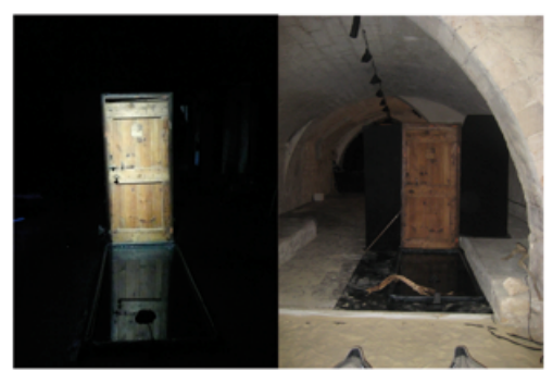
Porte 3 - Zone 3