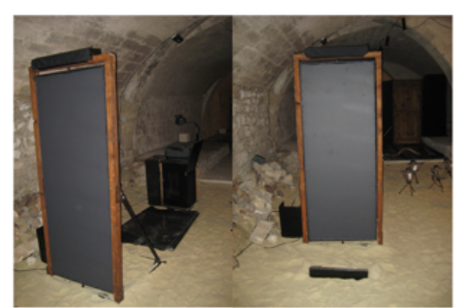
Porte 2 - Zone 2