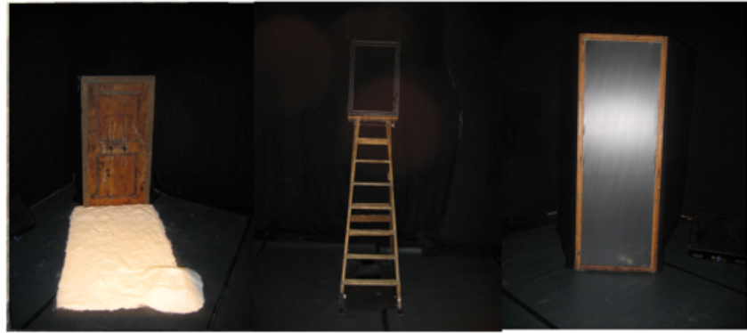
Porte 5 - Zone 5